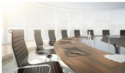
Small Meeting room